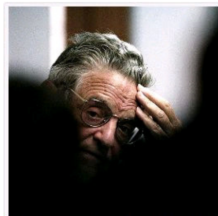
Flaws built into the euro from the start have become acute, Soros told a seminar, warning that the euro crisis could destroy the 27-nation European Union.

As both a differential interest rate policy and a change of exchange rates are unfeasible in a monetary union, De Grauwe now recurs to the third instrument of monetary policy in order to contain future growth differentials. In order to control excessive credit expansion and the emergence of new bubbles, De Grauwe advocates differential reserve requirements. He proposes to impose higher reserve requirements to banks of fast-growing economies. This idea would indeed be most appropriate if only the practical realization would not presuppose restrictions on the free movement of capital. The promotion of the free movement of capital was the prime objective and justification politicians used to justify the euro project. Or how the single currency increasingly gets entangled in its own contradictions.